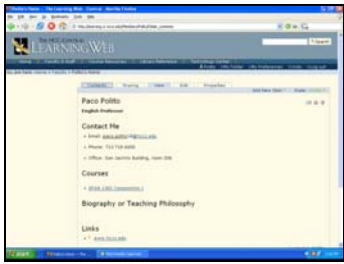
Slide 1 Note: Click the Contents tab