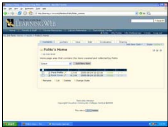
Slide 3 Note: Select the Add New Item menu