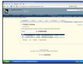
Slide 2 Note: