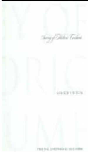
Survey of Historic Costume, 4th Edition